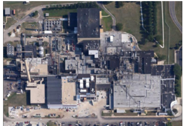
Bradley, IL - CSL Behring LLC, Bradley Kankakee Plasma Protein Plant ($150 million expansion in 2012-13, $240 million addition in 2015-18)