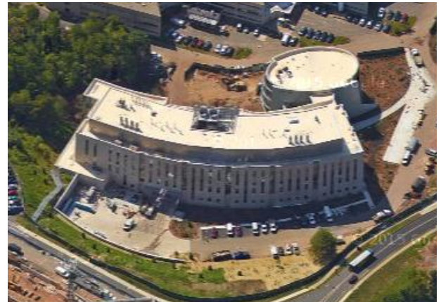
Farmington, CT – The Jackson Laboratory, Farmington Grassroot JAX Genomic Medicine Laboratory ($300 million construction in 2013-14)

Total Union Earnings (est.) (Union hours times average wage) $9.2 million