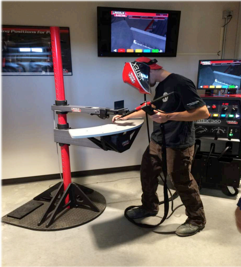
Union Apprentice, Plumbers & Pipefitters Local 773 demonstrating on a video welding training system.

Pharmaceutical Industry Labor-Management Association