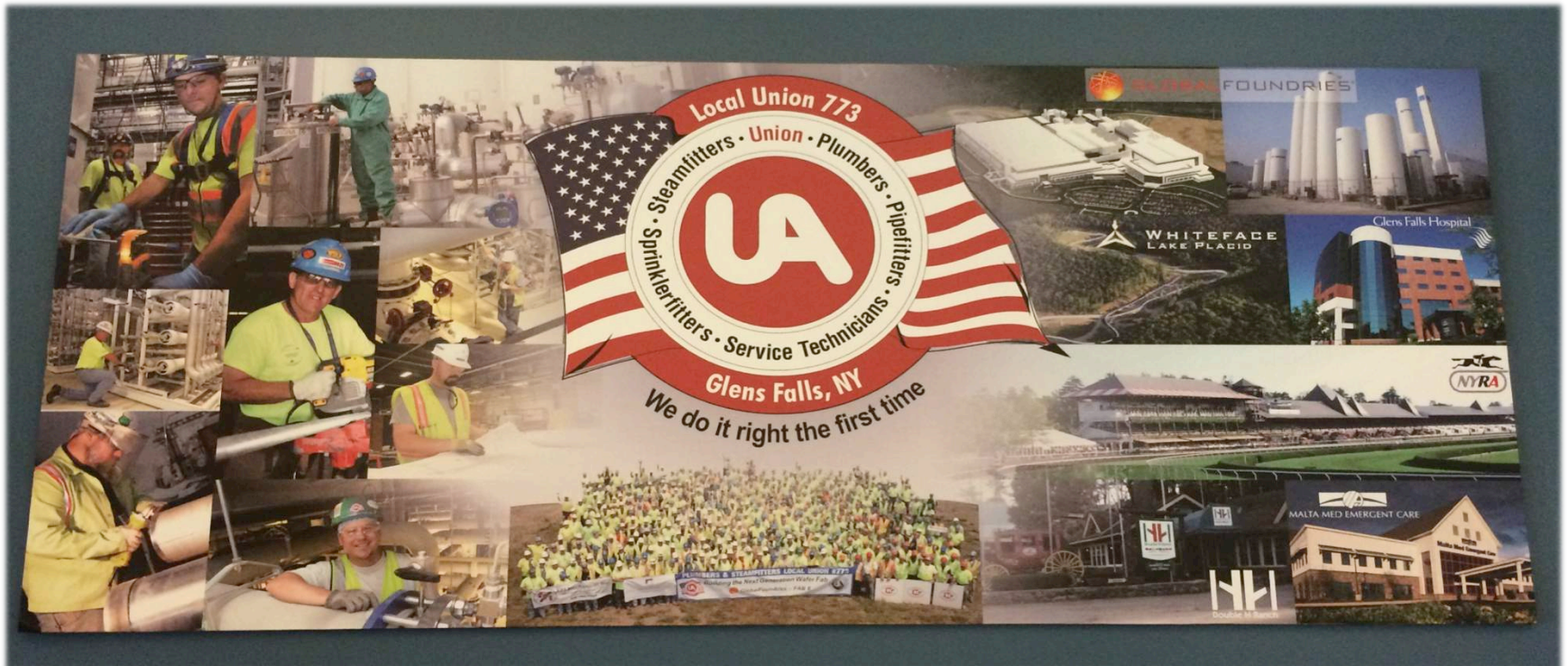
Plumbers & Pipefitters Local 773 banner showcasing the work they do throughout the region.

Pharmaceutical Industry Labor-Management Association