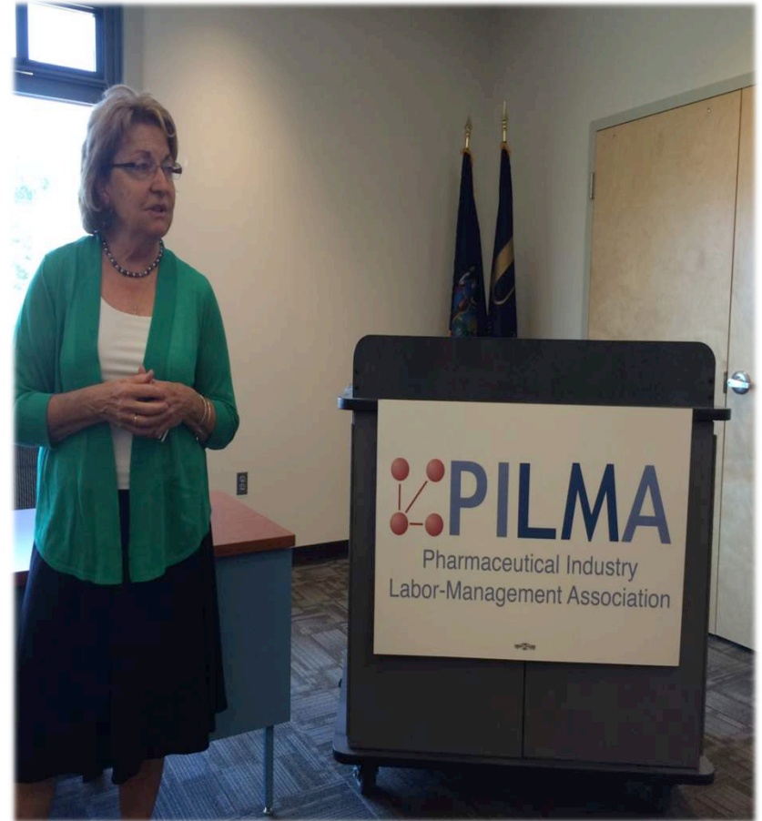
NYS Senator Betty Little discussing the potential for more jobs in the region through partnerships like PILMA.